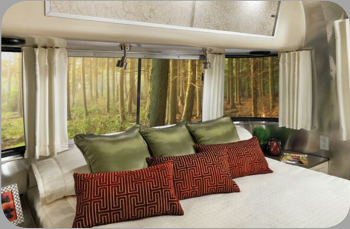
Sleeping in Serenity is as good as it sounds.