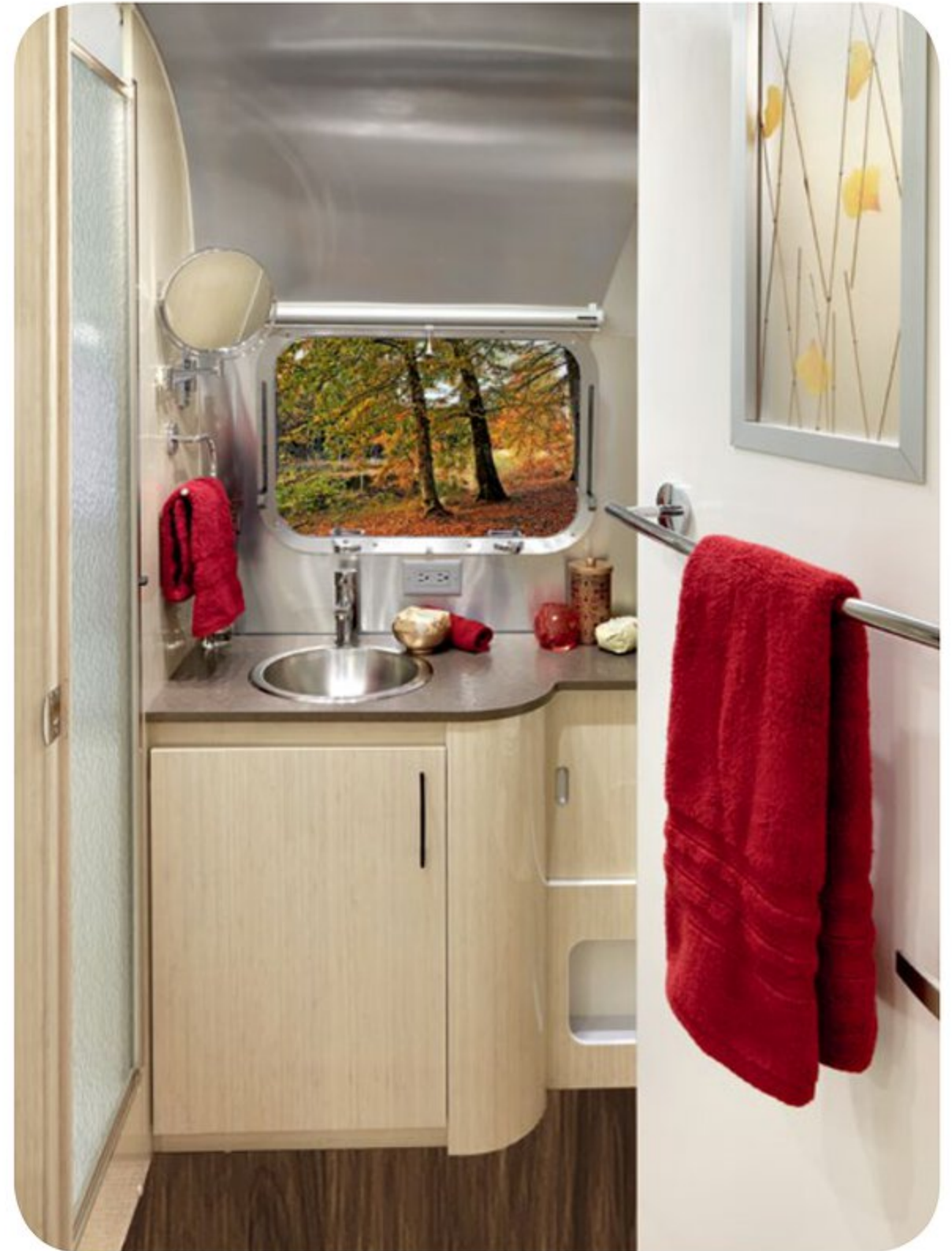
Soothingly spacious full bath.