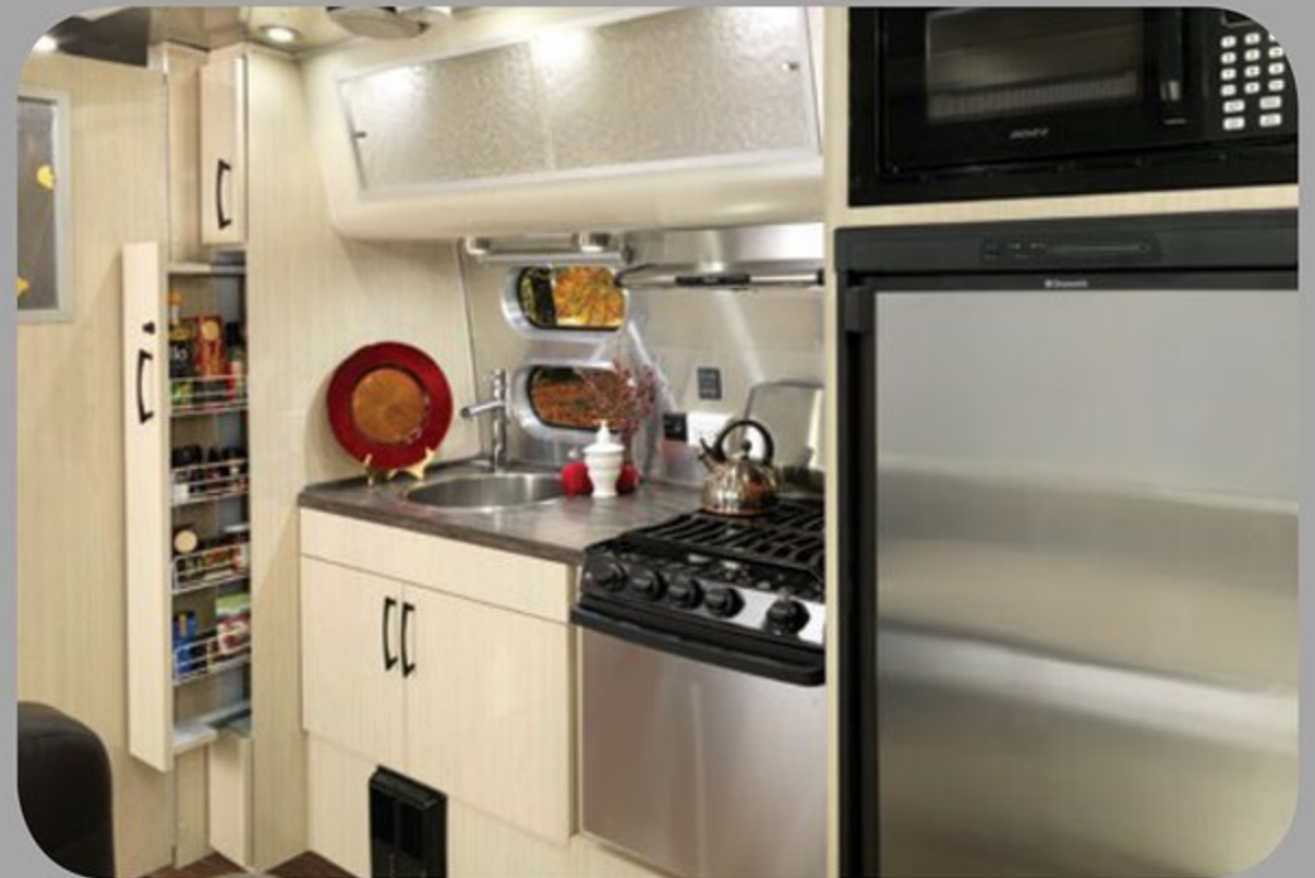
Space to stretch your cooking abilities.