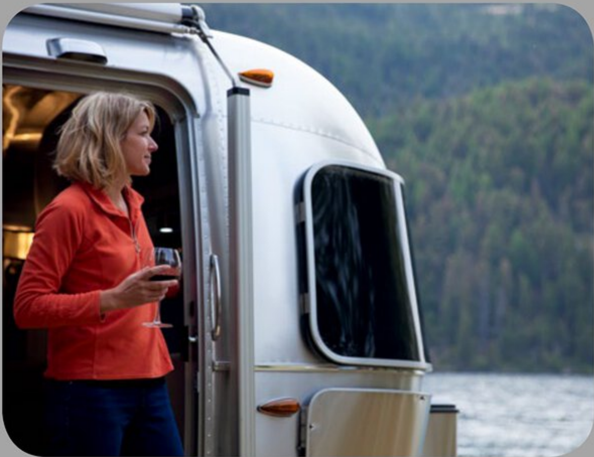
Traveling well means never missing a sunset.